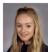
Business Support Assistant