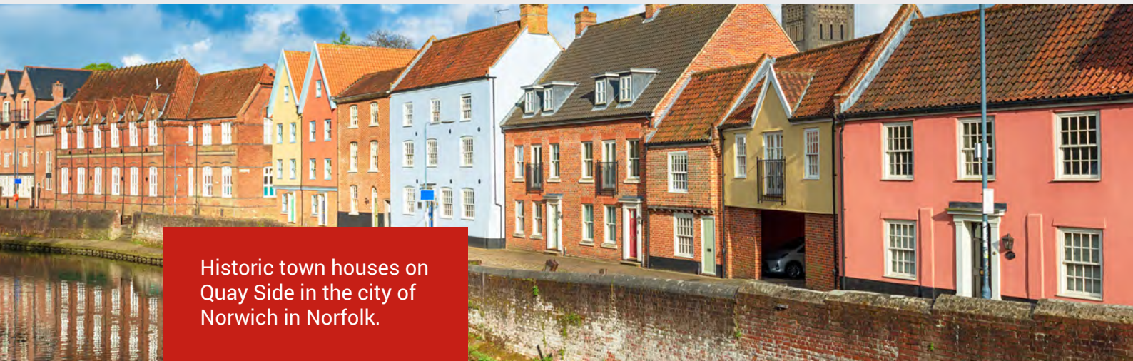
Historic town houses on Quay Side in the city of Norwich in Norfolk.

Getting around is a breeze, with regular trains to Cambridge and London, plenty of city bus routes and an international airport. Life in Norfolk is relaxed and exciting at the same time, whether you're into the vibrant nightlife or the stunning natural beauty of the Norfolk Broads. Voted the best place to work in the UK in 2015, Norwich is a city you are sure to fall in love with.